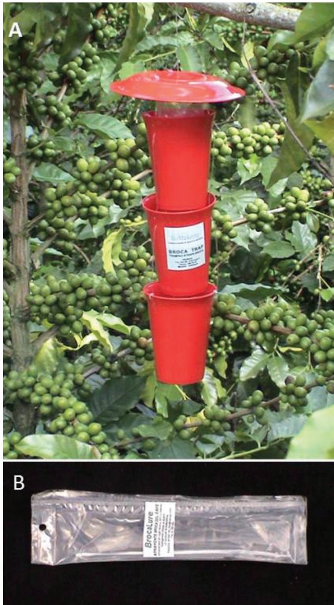
Fig. 1. A red funnel trap used to capture CBB ( Hypothenemus hampei ) (A) and the methanol-ethanol lure (3: 1 ratio) enclosed in a semi-permeable membrane (B). CBB were collected in a plastic container containing 200 mL of soapy water.

populations declined through the smaller harvest (Mar–Jun). Fewer CBB were collected in the small coffee farms (Viterbo) (averages of 38 to 105 CBB per trap/week), however, a similar seasonal trend was observed, with captures peaking from Jan–Mar (Fig. 2B). The start of the peak flight activity on smaller farms (Jan) again correlated with higher berry infestation (> 2.5%), and dropped later in the year as flight activity declined. A positive linear correlation (Pearson coefficient) between number of CBB captured and percent berry infestation was observed for both large ( r^2 = 0.90 ) and small ( r^2 = 0.68 ) farms. A similar relationship was reported by Pereira et al. (2012) in Brazil. However, their regression model could not determine an action threshold for CBB, since the intercept indicated that no CBB were caught at a low field infestation ( \approx 3 to 5% berry infestation), which was not observed in our study.